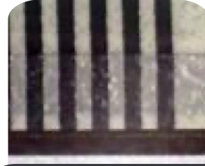
ACF Laminating Application