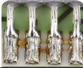
Reflow Soldering Application